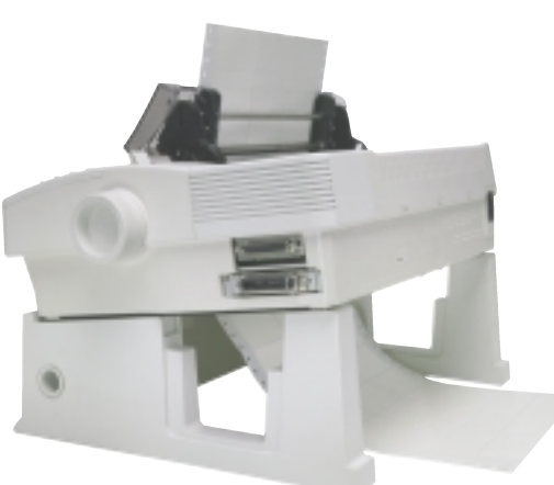
Printer shown bottom feeding labels on the optional printer stand